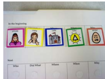
Top row done